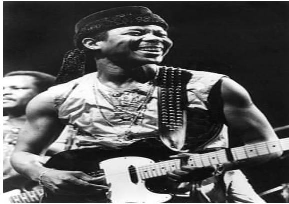
Pic. 2: King Sunny Adé on Stage