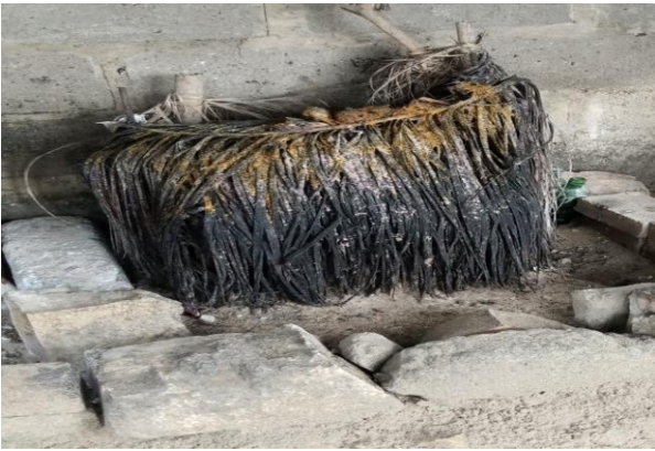
Pic. 1: An Ògún shrine.